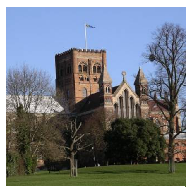
St Albans Cathedral